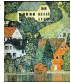
Houses at Unterach on the Attersee by Gustav Klimt

Organized, systematic government-sponsored or sanctioned art theft isn't a modern phenomenon, and one of the most diabolical tools in a government's arsenal is its ability to create laws of convenience. This visual presentation examines the obstructionist behavior of governments and institutions from ancient times to the modern day—and how journalists and detectives have overcome the hurdles to recover stolen art. You'll hear about: